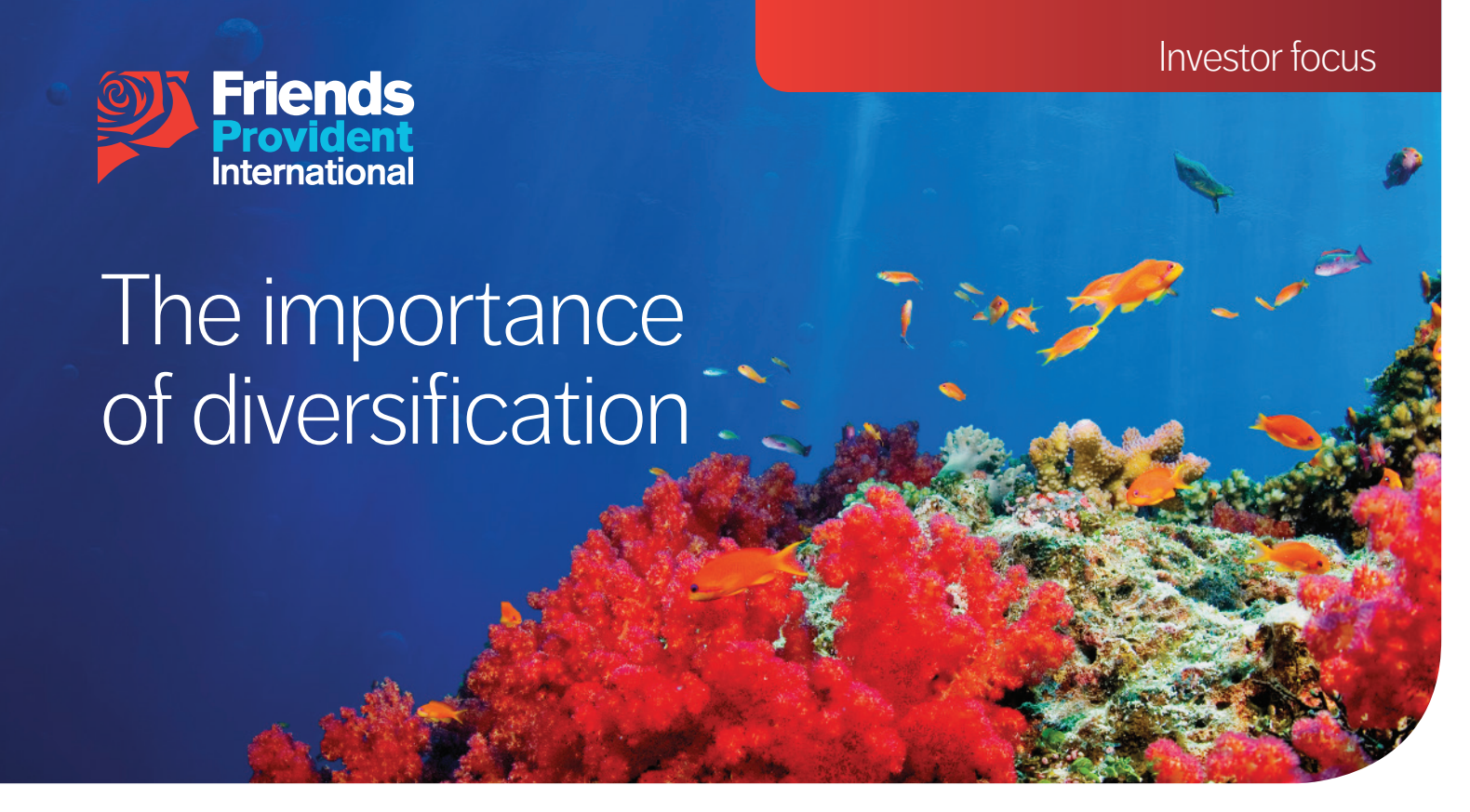
Not for distribution in Hong Kong or Singapore.

The question on most investors' minds at the beginning of every new year is 'which financial markets will top the performance charts over the next 12 months?' In the media, so-called 'investment experts' regularly make their predictions as to which asset classes will perform strongly or poorly.